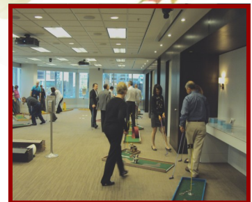
Mini - Golf tournament for United Way