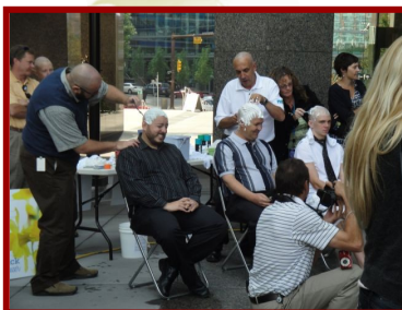
Head Shave for Canadian Cancer Society

We will be holding a Holiday Food Drive again this year. More details will be provided in the coming weeks.