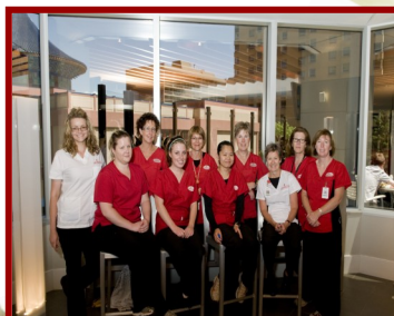
Red Cross Blood Donor Clinic